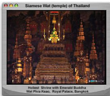
Holiest Shrine with Emerald Buddha Wat Phra Keao, Royal Palace, Bangkok