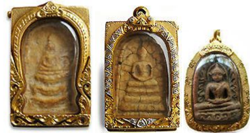
Probably Thailand can easily rank itself as one of the world's top 5 consumers of gold behind the Indian and Chinese. This is PARTLY related to their deeply rooted religious belief in Buddhist Votive amulets where best of personal collection should be encased in best of presentation. Other than Gold as a traditional investment channel, for hundred of years, consumable usage such as Jewelry and others such as Gold amulet casings makes gold usage grow steadily over the years. A Gold camera with association to the most respectable icon in this Kingdom will always form as basis of preservation of its collectible value.