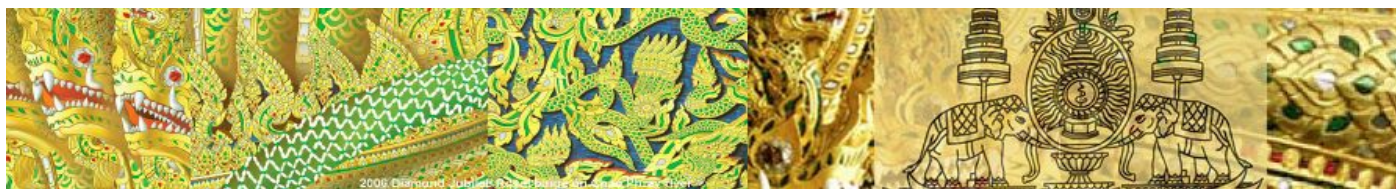
Leica M6 His Majesty King Bhumibol Adulyadej of Thailand 50th Anniversary of His Coronation GOLD Edition with matching Gold-plated Summicron-M 1:2.0/50mm, 1996